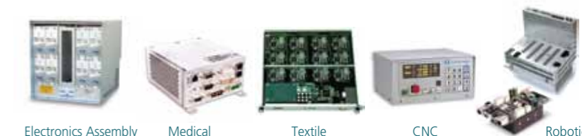
Optimized, Cost-Effective Solutions