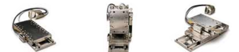
Positioning Slides and Systems