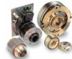
Wrap Spring and Friction Clutches/Brakes